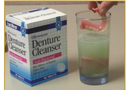
Clean and soak your dentures daily

Using a soft bristled toothbrush , brush your remaining teeth, as well as your tongue, palate, and gums. This not only removes plaque and keeps your breath fresh, it also massages your gums and stimulates circulation, keeping your natural teeth and tissues healthy.