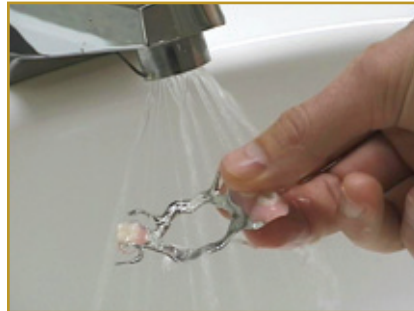
Rinse after eating